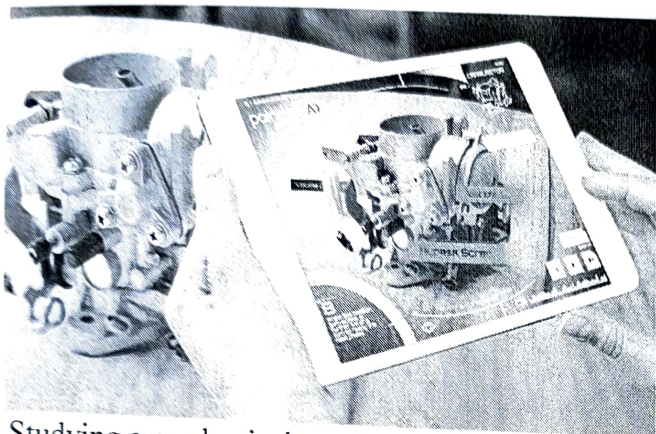
Studying a mechanical part by using augmented reality.

The most important decision of a student is to select what course or stream he should select. Well what if by viewing a single image of many fields and courses you get a brief idea that which course is used to implement which field. This will lead to